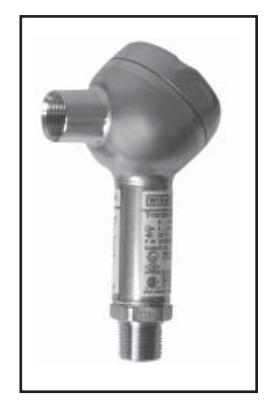
IS-20-F NEMA 4X Intrinsically safe