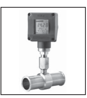
UT-10 on 981.22 INLINE SEAL<sup>™</sup> for sanitary applications