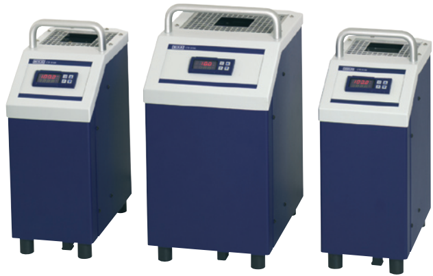
Temperature dry well calibrator Model CTD9100