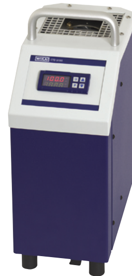
Temperature Dry Well Calibrator CTD9100-650