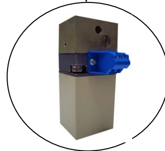
ABB I/P Part number: 7958070