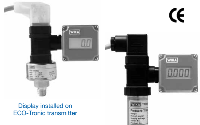
Display installed on ECO-Tronic transmitter