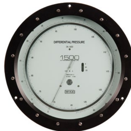
Differential Pressure Gauge Series 1500 - 8.5" Dial

Cast aluminum with tempered-glass window; flush mounted by three screws through the bezel