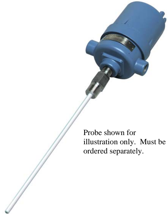
Probe shown for illustration only. Must be ordered separately.

The sensing probe capacitance is directly proportional to the process variable which is the signal desired. This "true" capacitance value is "charged" through a fixed resistor from a regulated DC Voltage source within the instrument. When the charged value reaches a pre-determined voltage level, it is instantaneously discharged and the cycle is repeated. This charging rate is compared to the charge rate of fixed reference capacitors, each fixed charge rate being adjustable by means of