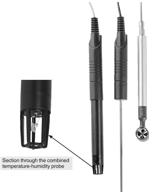
Section through the combined temperature-humidity probe