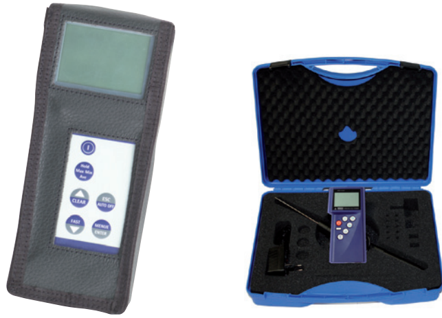
Fig. left: hand-held thermometer model CTH6510