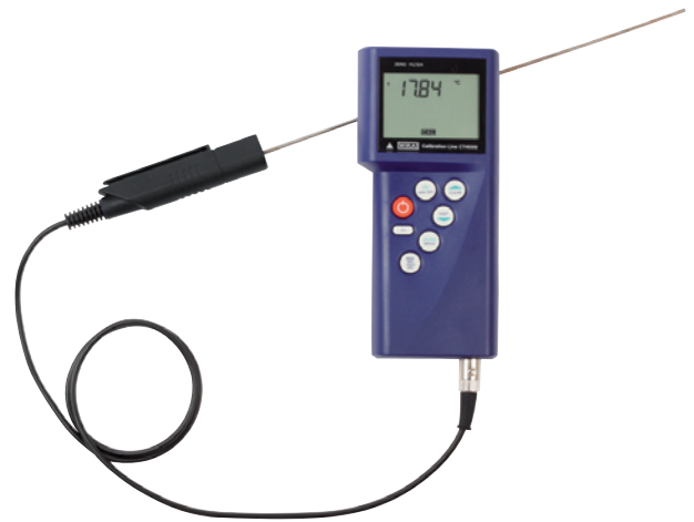
Hand-held thermometer model CTH6500