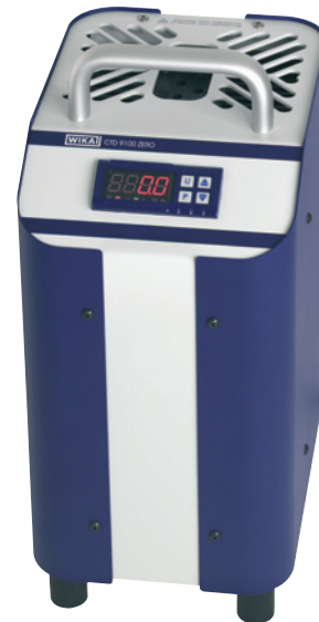
Temperature Dry Well Calibrator Model CTD9100-ZERO