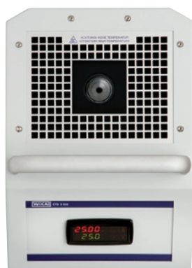
Model CTD9100-165 or model CTD9100-COOL temperature dry well calibrator

Four instruments for a temperature range from -55 ... +650 °C