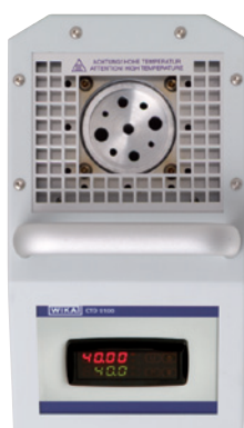
Model CTD9100-450 temperature dry well calibrator

Mains connector socket, power switch and fuse holder are located centrally at the front of the underside of the instrument.