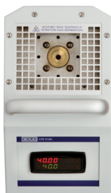
Model CTD9100-650 temperature dry well calibrator

The CTD9100-450 is used in the medium temperature range up to 450 °C. It generates its temperature with resistive electrical heating and features an enlarged insert with Ø 60 mm. Thus it is possible to calibrate several temperature sensors simultaneously or to calibrate thermometers with various diameters without having to change the sleeve.