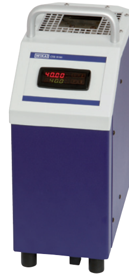
Temperature dry well calibrator CTD9100-650