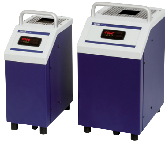
Models CTD9100 temperature dry well calibrators