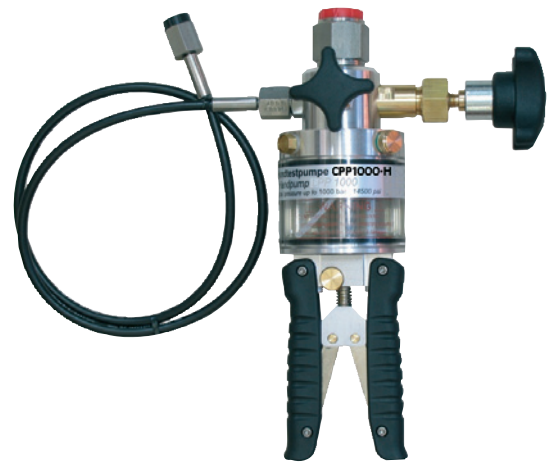
Hand test pump model CPP1000-H