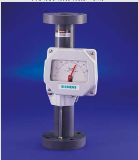
PVC Tube Varea-Meter® Unit

There are no float extensions. In and out piping is vertical. No spool pieces are required at installation.