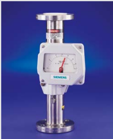
TFE-Lined Varea-Meter® Unit

PVC meter: the metering tube and float body are Type I, Grade I PVC. Metering disk is Hastelloy® C, tantalum, or Kynar®.