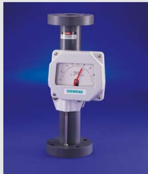
PVC-Tube Varea-Meter® Unit