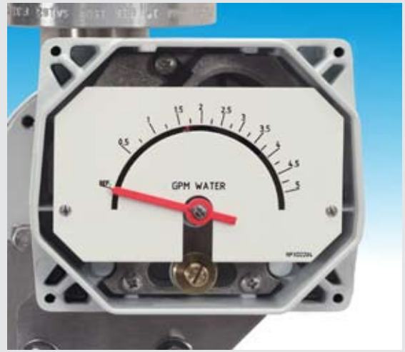
Integral flow switch (shown with cover removed)

The Wallace & Tiernan® Integral Flow Switch is a low-cost switch that mounts inside the meter's indicator and enables remote monitoring of either high or low set points. The switch is housed in the indicator, which is in a NEMA 4 enclosure with a plastic window; a glass window is available as an option. There is also an FM-approved, intrinsically safe arrangement with a power supply and an integral (to the power supply) relay available for Class I, II & III, Division 1 & 2 hazardous areas.