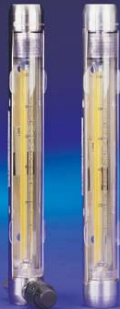
Low Flow Meter Flow Measurement

The frame is made of 302 stainless steel; the end fittings, 316 stainless. The metering-tube retainer is Kynar® vinylidene fluoride resin with 316 stainless optional. O-rings come in a choice of Buna N or Viton® with EPR (ethylene propylene rubber) and Kalrez® optional. Valve trim (seat and stem) is 316 stainless.