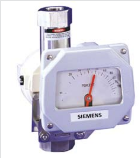
Armored Flowmeter with NPT connections and optional external flow switch

The user can easily set the switching point by removing the indicator cover and moving the switch pointer tip (located in the slot) to the desired set point. Any value along the slot can be used as the desired set position. The placement of the pointer tip provides a local and visual indication of the set point. The disc mounted on the indicator needle actuates the limit switch within the housing. This compact, inexpensive switch gives a reliable high- or low-flow signal even under sudden flow surges. The alarm can be set to open or close on increasing or decreasing process flow.