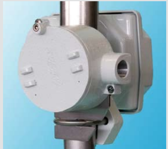
Electronic Flow Transmitter mounted on meter body

The Wallace & Tiernan® Products Varea-Com™ explosion-proof Electronic Transmitter provides accurate magnet angle detection and computation of the angle to a 4-20 mA industry standard output signal. This compact, microprocessor-driven device is capable of filling flow-correction needs at the meter, providing accurate flow information remotely to external support systems. The patented magnetic sensor with automatic gain control enables a high dynamic capture range without sacrificing accuracy.