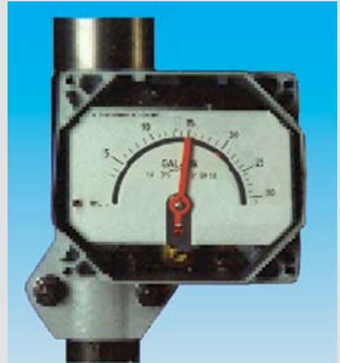
Integral flow switch (shown with cover removed)