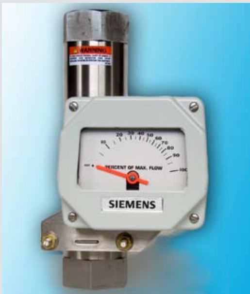
Armored flowmeter with NPT connections

Note: To determine Fe for specific gravities not shown in Table F, use liquid-specific gravity correction equation.