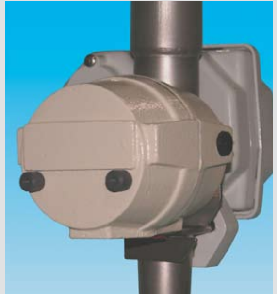
External general purpose flow switch mounted on meter body

The Wallace & Tiernan® External Flow Switch is a compact option that gives reliable high- and/or low-flow switching. The External Flow Switch contains a powerful rotating magnet that responds linearly to float position. Its switches are long life, hermetically sealed reed types. Almost frictionless rotation of the switch magnet and its powerful bond with the float magnet give a dependable magnetic coupling. Even under sudden flow surges, switching remains reliable.