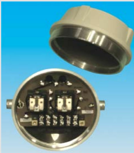
Flow switch with switches and relays