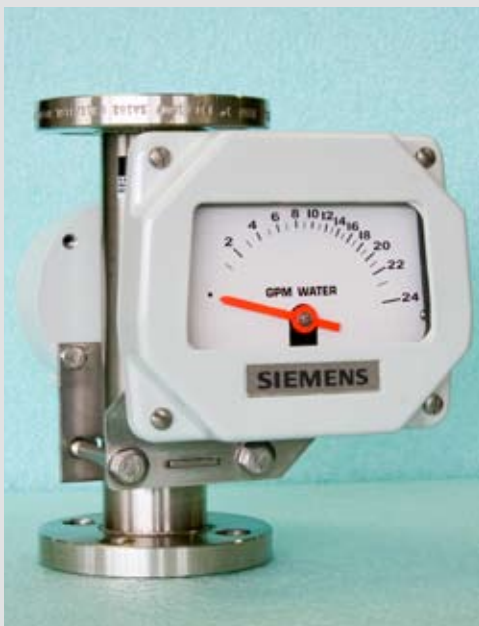
Armored Flowmeter with 150 lb. RF flanged connections