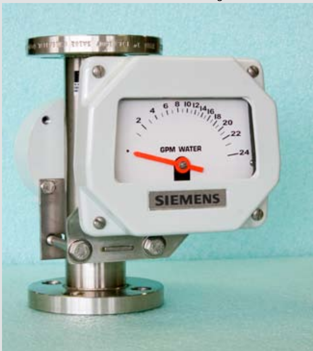
Armored Flowmeter with 150 lb. RF flanged connections

Limits are 1500 psi and 400°F (with Viton® O-rings) for NPT connections. For flange connections refer to ANSI Spec B16.5 for temperature and pressure ratings.